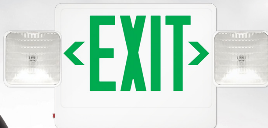
EXIT & EMERGENCY