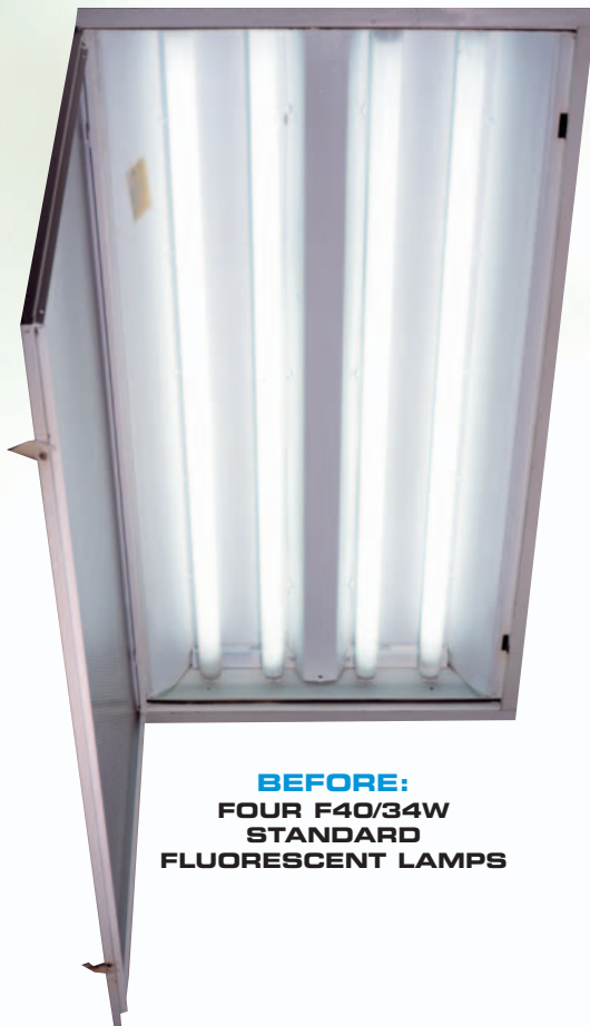
BEFORE: FOUR F40/34W STANDARD FLUORESCENT LAMPS

THAT'S OVER A 30% ENERGY REDUCTION, OR A SAVINGS OF $31.25 ANNUALLY PER FIXTURE!