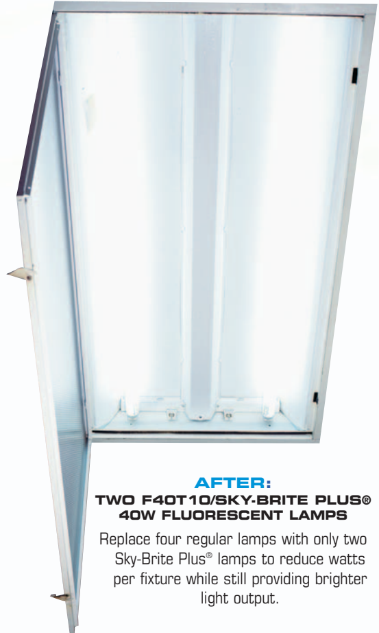
AFTER: TWO F40T10/SKY-BRITE PLUS® 40W FLUORESCENT LAMPS

Replace four regular lamps with only two Sky-Brite Plus® lamps to reduce watts per fixture while still providing brighter light output.